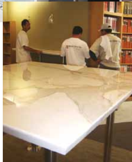
The company has a total of 12 workers, including two in the office.