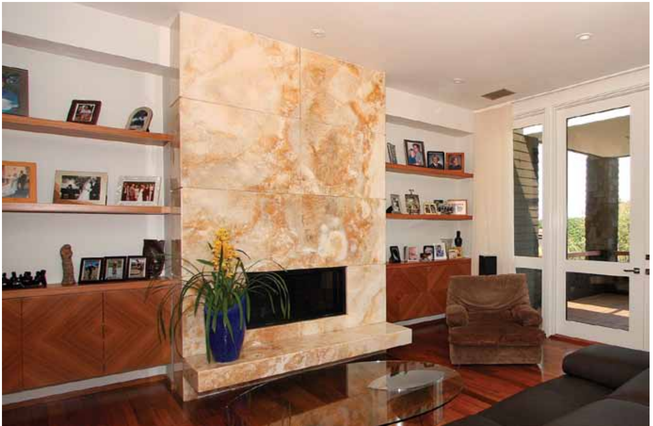
Slab fireplaces are also a company specialty.

pretty much all of them — Cambria, Caesarstone, Silestone, Chroma, Compac.”